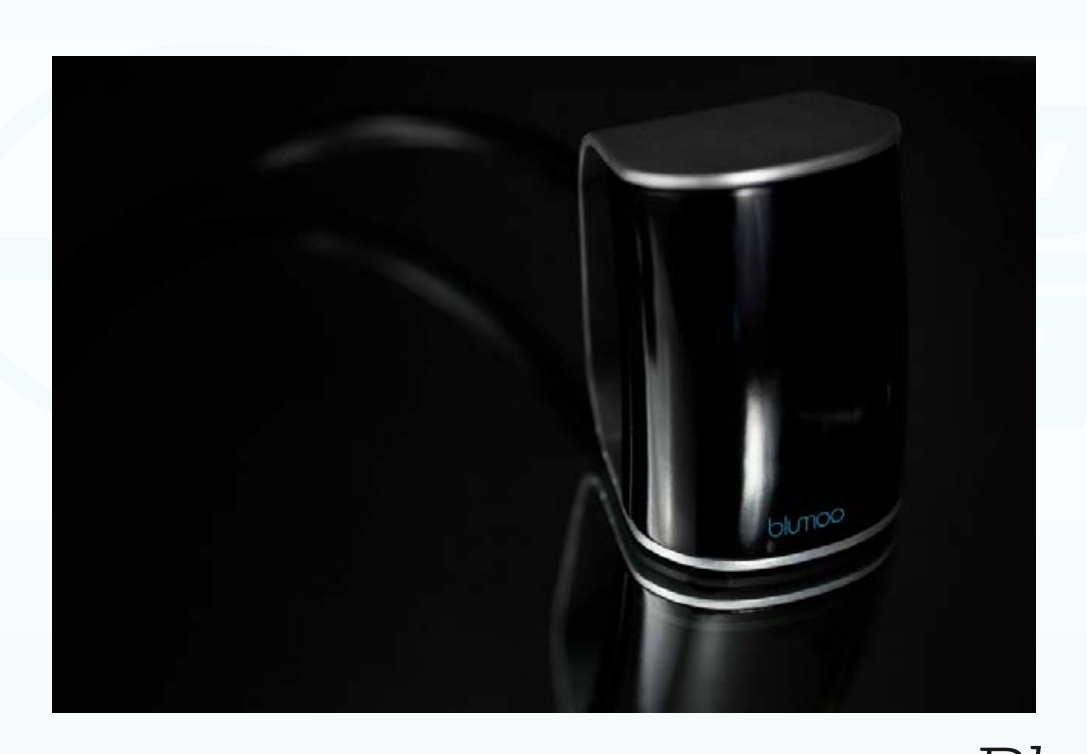
Blumoo Bluetooth Remote Control for Smartphones