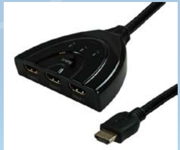
This auto-switching HDMI cable is a great add-on if you don't have enough HDMI inputs.

This box's ability to feed any monitor is great for people who don't watch a lot of TV but still want the option. While you can get a lot of live video on the internet, not everyone has an unlimited data plan. This is the device your college-bound child will love in the last three days of the month after they've hit their data cap.