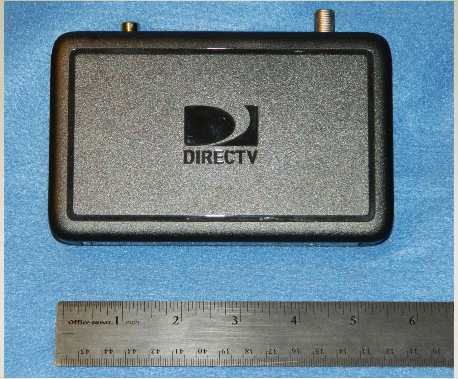
Print this page out for an actual-size view of the C31.

It's about time. We've been <u>talking about RVU</u> for a long time. DIRECTV's <u>HR34</u> is the first device on the market to use this technology, and the idea is that RVU-enabled TVs and set-top boxes will let the HR34 do all the work. This keeps costs down and also keeps the racket down... smaller devices don't need big fans like DVRs do.