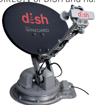
Winegard Trav'ler Pro for DISH

If you want your passengers to be able to watch satellite TV while you're driving, there's really only one good choice. In-motion satellite systems tend to be too large for RVs, but Winegard has created their Roadtrip T4 which is small enough to fit on the roof of an RV. The Roadtrip T4 is compatible with DIRECTV or DISH and has dual outputs to support two receivers or one Hopper Duo DVR.