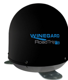
Winegard Roadtrip T4