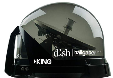
KING Tailgater Pro

Depending on your budget and personal preferences, you may want to choose one of the other options available at Solid Signal. If you don't need to connect two receivers, you can save a little money by opting for the Tailgater (DISH) or the KING Quest (DIRECTV) . Each is very similar to the more expensive units above, but only has one satellite receiver output. They also use a solid-color cover.