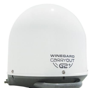
Winegard Carryout G2