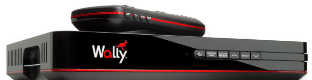
Wally receiver for DISH