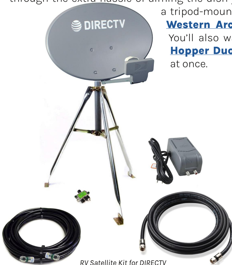
RV Satellite Kit for DIRECTV

DISH customers tend not to choose tripod-mounted dishes, because they can get HD programming using smaller self-aiming dishes. The DISH version of these products is less expensive than the DIRECTV version, making it less likely that you'll want to go through the extra hassle of aiming the dish yourself. If you are interested in getting a tripod-mounted solution for DISH, just combine this Western Arc dish with this tripod and this mast . You'll also want a Wally receiver to watch TV or a Hopper Duo DVR to be able to record two programs at once.