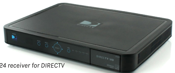
H24 receiver for DIRECTV