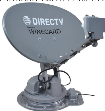
Winegard Trav'ler Pro for DIRECTV