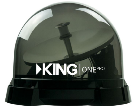
KING One Pro

DIRECTV customers will need a H24 satellite receiver to complete the package, while DISH customers can choose a Wally receiver for a Hopper Duo DVR .